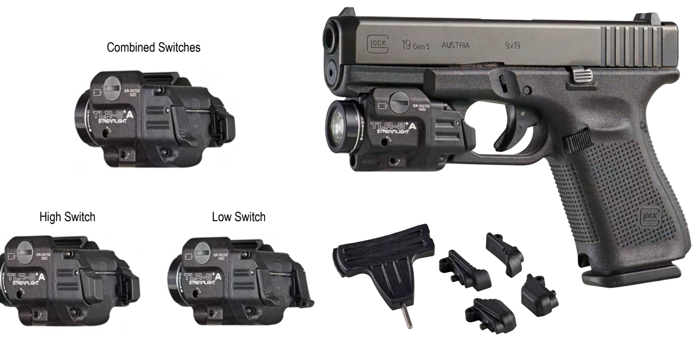
FOR THOSE WHO PREFER A "HIGHER GRIP STYLE"